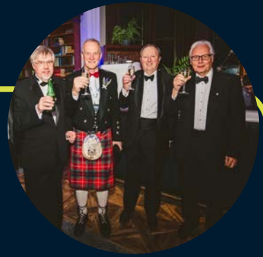
COLLEAGUES & FRIENDS